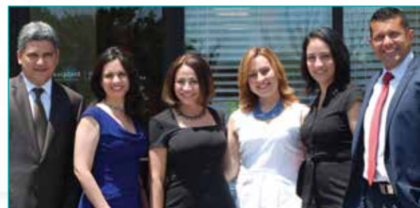
ClearPoint Hispanic Center for Financial Excellence Staff

We have seen strong outcomes and positive behavior changes among our initial HCFE clients. Of those who were unbanked when starting the program, 50% have opened a checking or savings account. Among clients who had a credit history when they started the program, 40% improved their credit scores. ClearPoint expects to help 500 families and individuals in 2014 maintain financial stability through the HCFE.